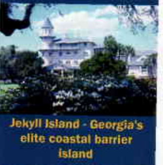
Jekyll Island - Georgia's elite coastal barrier island