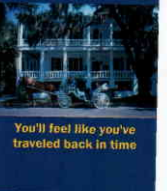
You'll feel like you've traveled back in time